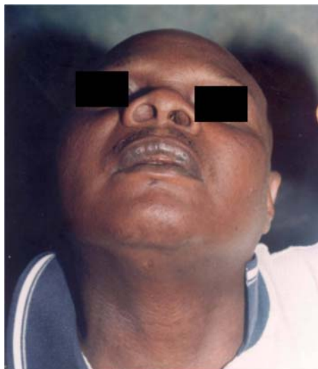
Figure 1: Observe the mass in the right nasal cavity

Examination of the nose revealed a firm mass on the lateral wall of the right nasal vestibule extending to the inferior turbinate (Fig. 1).