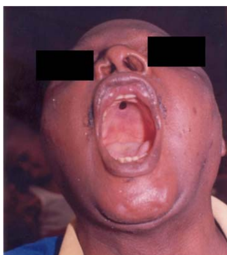
Figure 3: Perforation of the anterior aspect of the hard palate.

A nasal swab was taken for mycotic study with a report of heavy growth of Aspergillus Fumigatus . The treatment was changed to oral fluconazole (Diflucan) and douching with miconazole (Daktarin) cream. He improved on this treatment, thereafter he had surgical closure of the oro-nasal fistula.