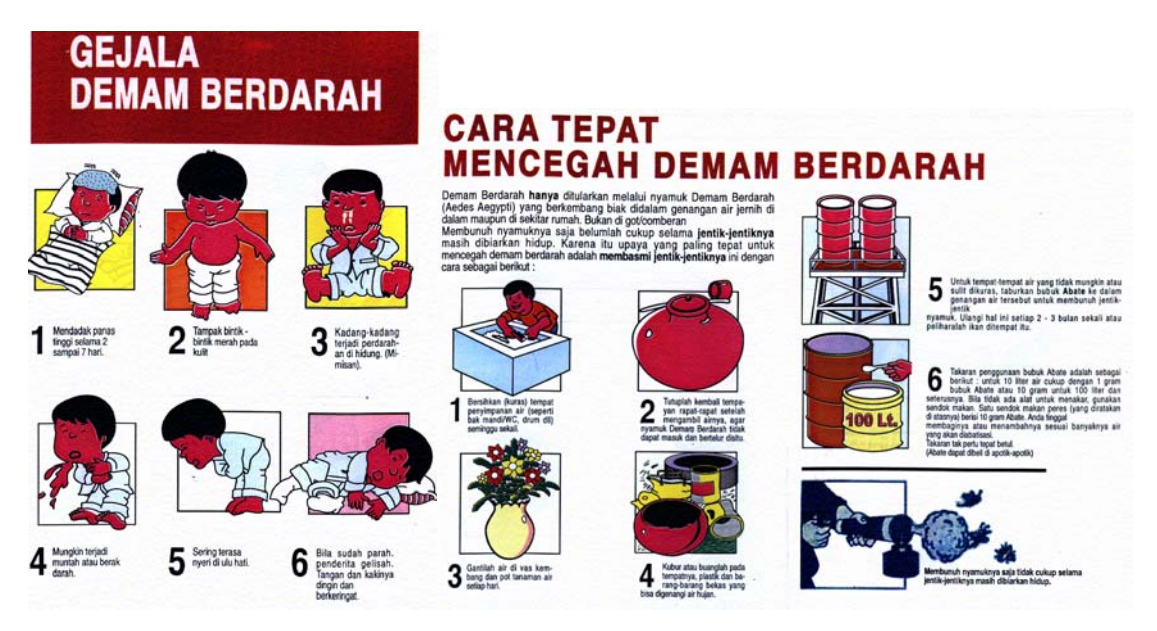
Figure 3 – "Breeding sites of and control of DHF vectors", handout to the community for general distribution.

It is hoped that inaccurate national beliefs implied by the following diagram (Fig. 4) will be remedied with this education program.